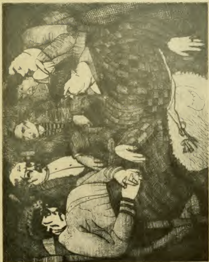
"STOUTLY MAINTAINED WITH TEARS IN HER EYES."